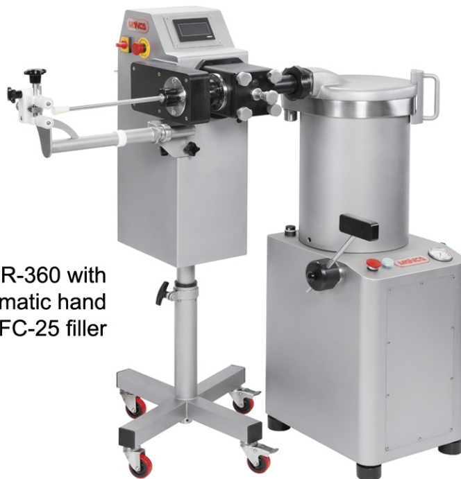
PR-360 with automatic hand and FC-25 filler