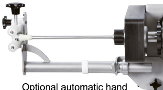
Optional automatic hand 2PR36MM